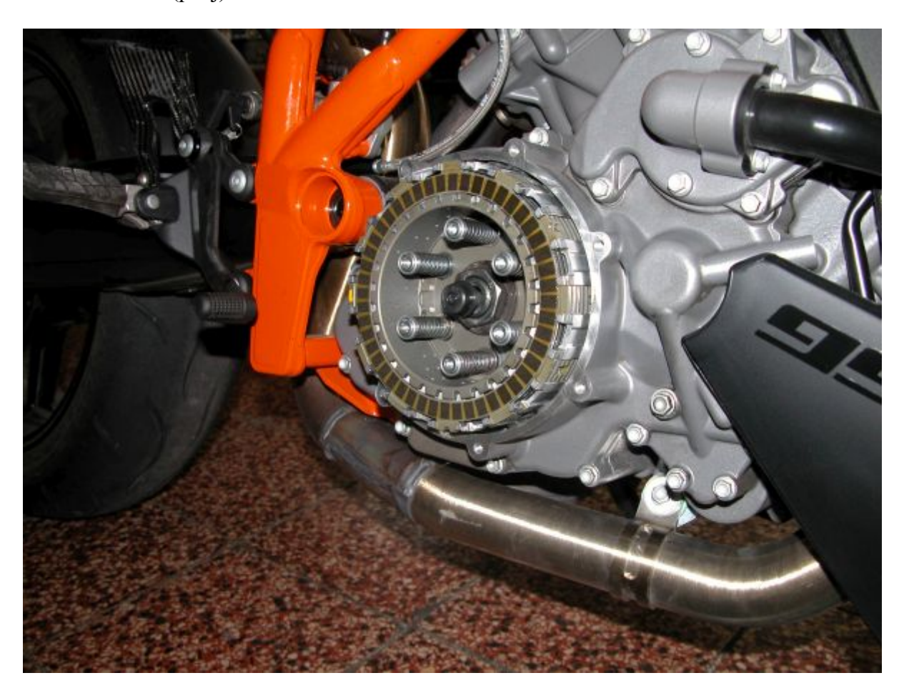
17103 Picture K (pic.k)