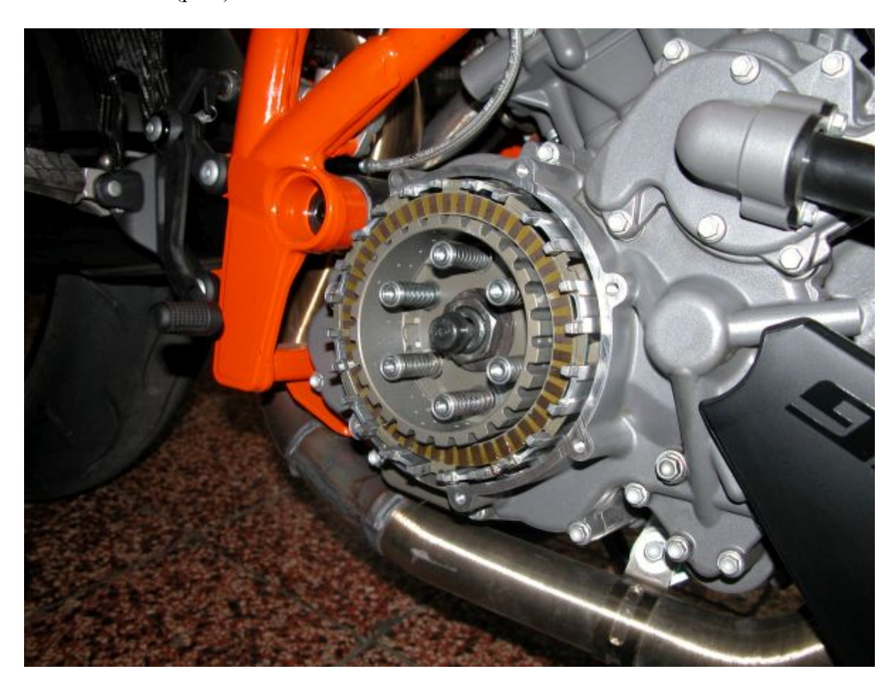
17103 Picture G (pic.g)