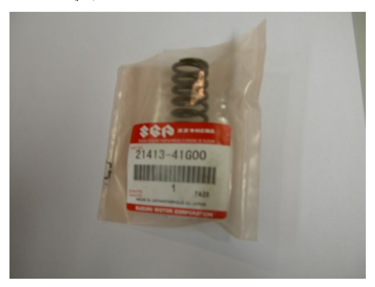
17103 Picture M (pic.m)