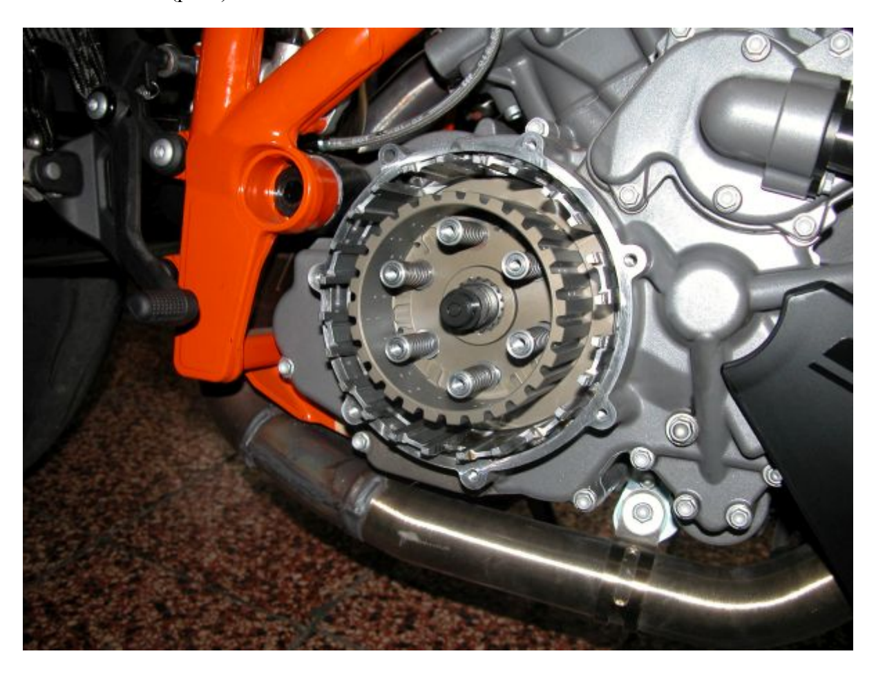
17103 Picture C (pic.c)