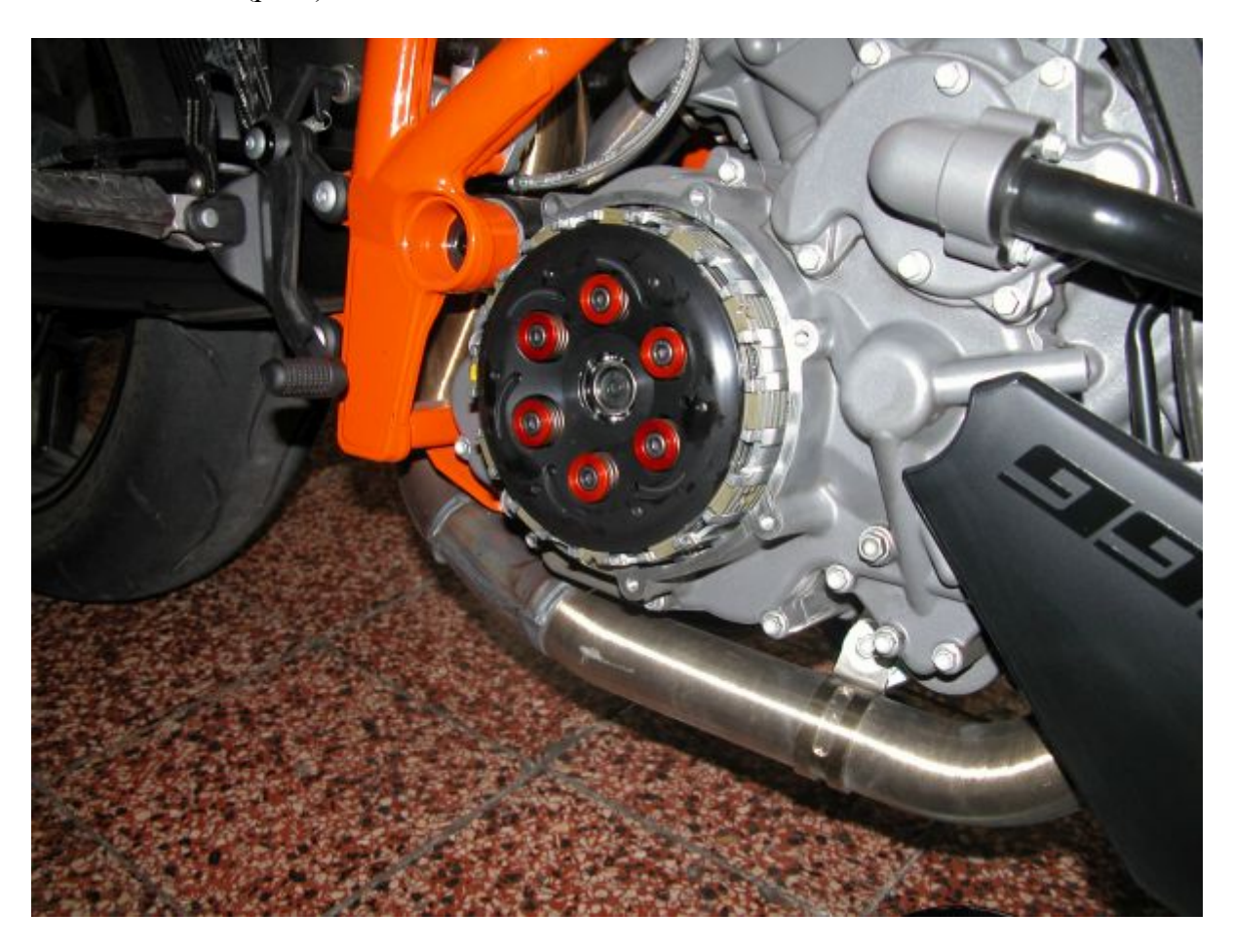
17103 Picture O (pic.o)