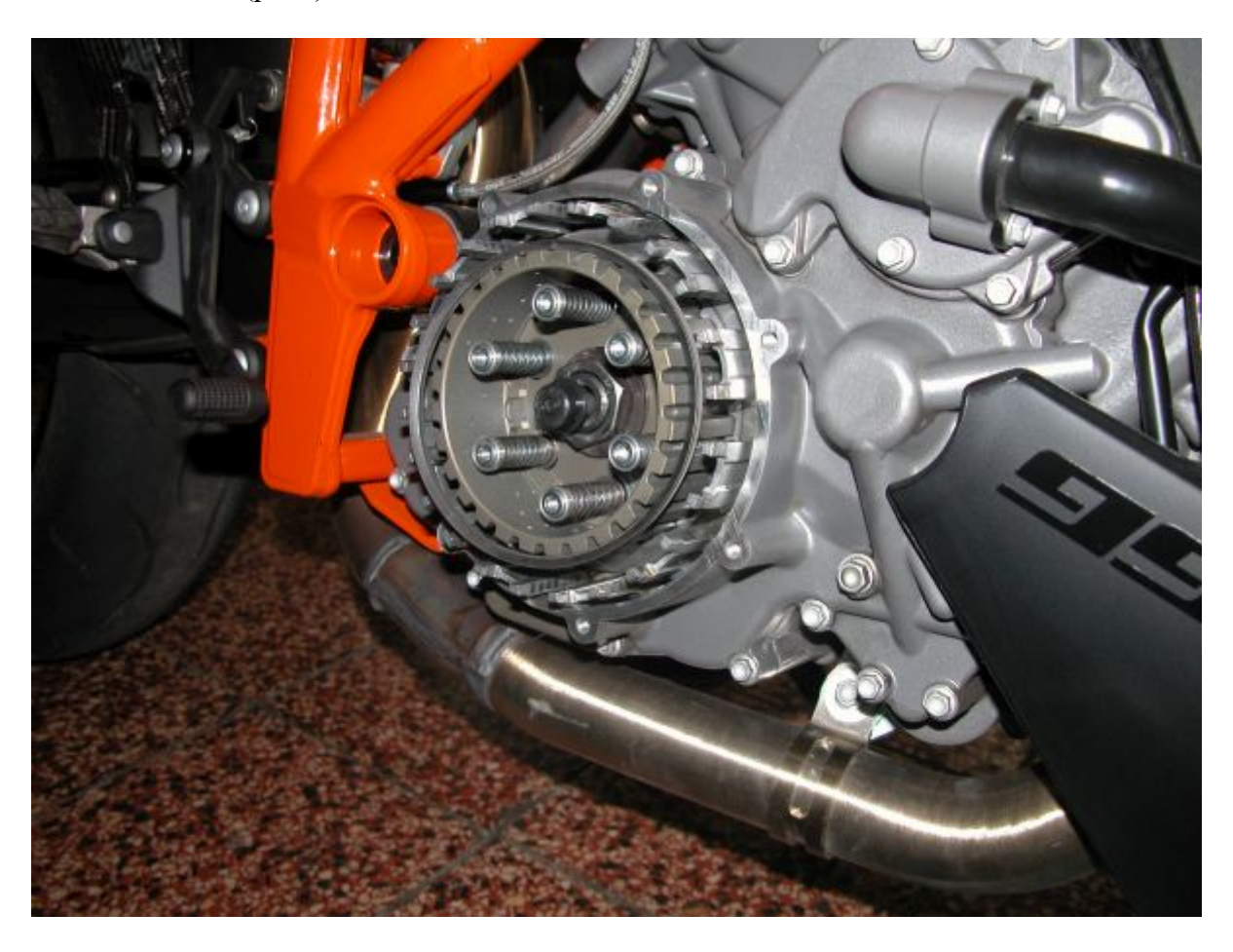
17103 Picture I (pic.i)