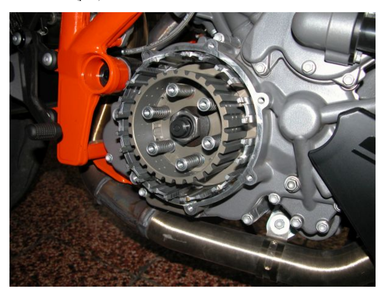
17103 Picture E (pic.e)