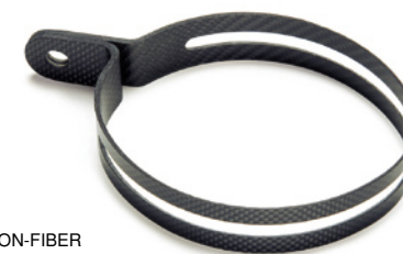
CARBON-FIBER MUFFLER CLAMP